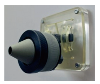
Fig. 1 GSP sampling head (DGUV 2016)