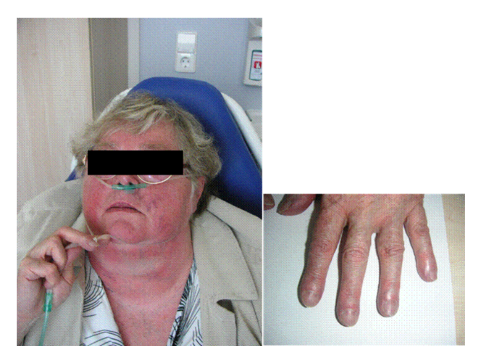
Figure 1: Clinical findings in a patient with chronic right heart insufficiency and severe pulmonary hypertension