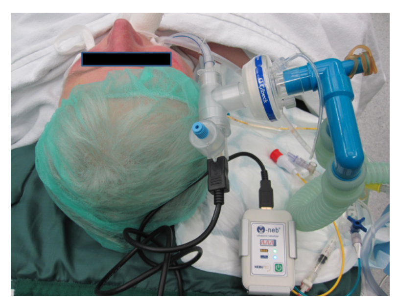
Figure 2: Intraoperative selective pulmonary vasodilation with inhaled iloprost via ultrasonic nebulizer (m-neb<sup>®</sup>, nebutec Elsenfeld, Germany) in the ventilatory circuit

In view to general anesthesia the main advantages are safe oxygenation and uncomplicated airway management, and intraoperative selective pulmonary vasodilation can - if necessary - easily be administered through the breathing circuit (Figure 2). Anesthesia-induced systemic vasodilation and mechanical ventilation can lead to a significant drop in mean arterial pressure, which has the potential to endanger myocardial perfusion and critically affect right-ventricular contractility [26]. All standard induction anesthetics can, in principle, be used in combination with opioids, as they have no influence on pulmonary vascular resistance and oxygenation [27]. Histaminereleasing relaxants (atracurium, mivacurium) should be avoided for patients with pulmonary hypertension, as they may further increase pulmonary resistance [27]. Volatile anesthetic agents of concentrations up to 1 MAC can be administered without any negative effects on pulmonary pressure and resistance [26]. We suggest a balanced technique, mixing higher doses of opioids and low-dose volatile anesthetic agents [22].