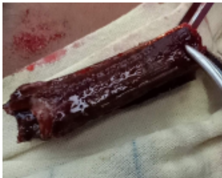
Figure 4: Wooden foreign body measuring 4 cm x 1 cm

Under general anaesthesia, lateral canthotomy was done, and a twig measuring around 4 cm x 1 cm was removed (Figure 4). Then inferior orbitotomy through a conjunctival incision was done, and the bony defect was sealed with a silicone sheet (Attachment 1). Layered closure of the wound was performed, followed by canthoplasty.