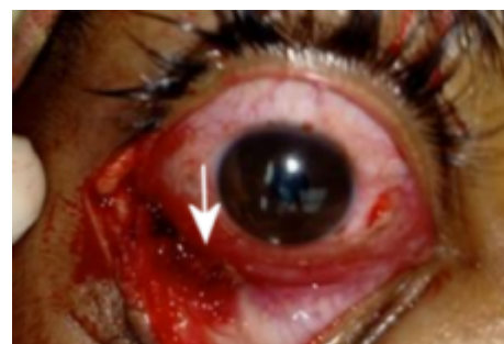
Figure 2: Intraoperative photograph showing the entry site in the inferior fornix (arrow)

On examination, the patient had right-sided superior displacement of the globe and limitation of movement in all gazes. Lower lid edema was present, but the periorcular skin had no external scar (Figure 1). 2 mm proptosis was present on the right side. On further evaluation, one end of a wooden stick was noticed in the inferior fornix with congestion of inferior fornical conjunctiva and granulation tissue around the entry wound (Figure 2). Fundus exam-