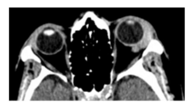
Figure 1: Orbital CT, axial view shows an infiltrative lesion, located in the left lacrimal gland.

Orbital CT imaging revealed an infiltrative hyperdense lesion in the left lacrimal gland, encircling the globe, the muscle cone and the lateral and proximal portions of the optic nerve, without invading any of these structures, nor the extraocular muscles or the orbital walls (Figure 1). On ocular ultrasound the lacrimal gland lesion exhibited well defined borders, internal homogeneous structure and medium/low reflectivity.