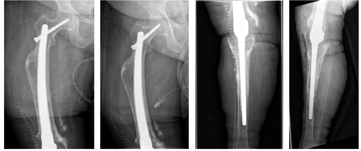
Figure 9: The postoperative radiographs showed correct implant position and a satisfactory surgical result.