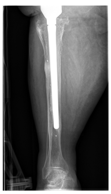
Figure 10: The radiological findings one year after surgery show no sign of loosening or any other pathological findings.

firmed the diagnosis of peroneal lesion. The patient was supplied by orthopedic shoes and orthesis. Further, electrotherapy was carried out.