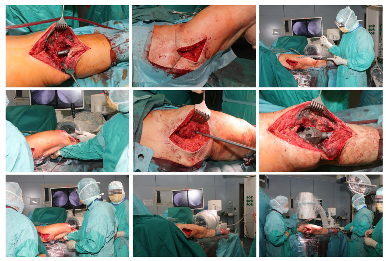
Figure 7: Intraoperative steps (see text)

Lateral approach to the thigh, exposure of the femoral shaft and the fracture, exact measurements according to preoperative planning to identify the planned level of resection. Exposure of intramedullary femoral stems, the diaphyseal femur the implants were cemented and additionally secured circularly with screws to the two stem parts after setting the correct rotation. Then, the two parts were connected using the screws provided.