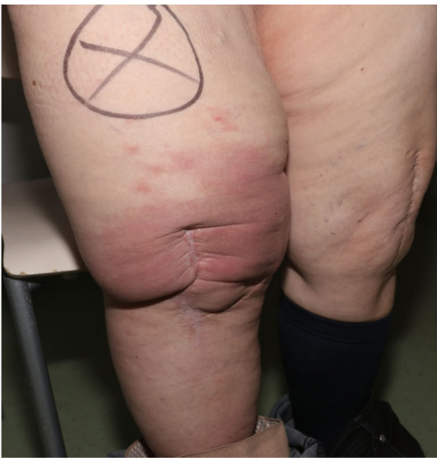
Figure 4: In 2022, local signs of infection