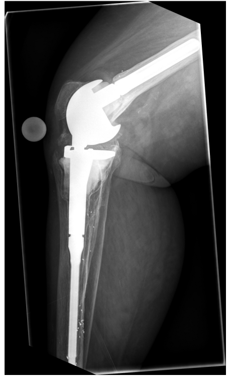
Figure 1: Preoperative X-ray of the right knee joint (in 2016) showing aseptic loosening of the components