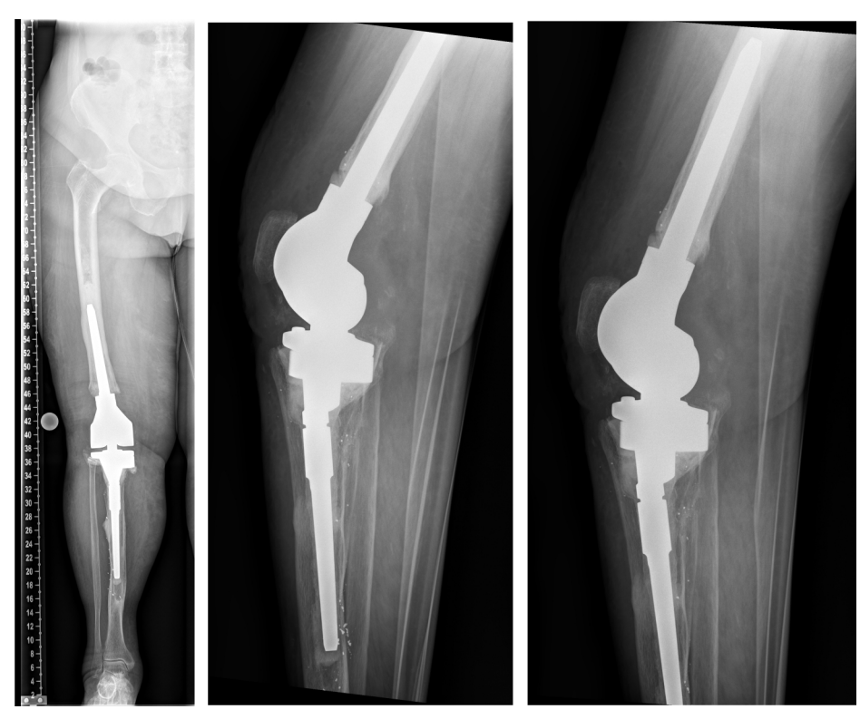
Figure 2: Postoperative X-ray of the right knee joint (in 2016) showing total knee and distal femoral replacement

presented to us with insufficiency of the extensor apparatus. According to the clinical picture, especially the macroscopic findings during surgery, infection could not be ruled out. Therefore, explantation of the components was carried out with implantation of a cement spacer. The histological and microbiological findings ruled out infection. Therefore, an intramedullary arthrodesis of the knee was carried out during the same hospital stay (Figure 3). In 2022, the patient again complained of pain and we detected loosening of the femoral component. Despite the fact that no microbes were ever isolated in the right knee, we suspected low grade infection, as loosening occurred within less than 2 years accompanied by local signs of infection (Figure 4). Explantation was carried out with implantation of a cement spacer with intramedullary carbon nails (Figure 5). Yet, the histological and microbiological investigations ruled out infection.