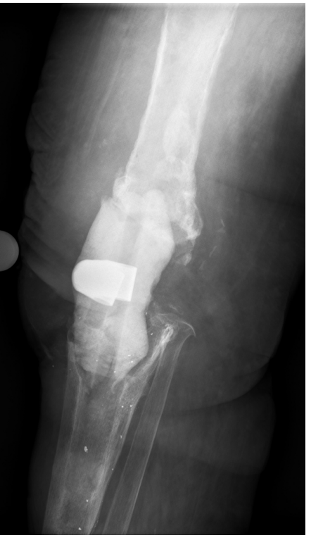
Figure 5: Explantation of the nail was carried out with implantation of cement spacer with intramedullary carbon nails.

by PETER BREHM GmbH (Weisendorf, Germany) within 6 weeks (Attachment 1). A special device was introduced to adjust rotation of the femoral nail prior to its implantation in order to adequately place the femoral neck screw (Attachment 1). The surgical procedure was explained to the patient in detail.