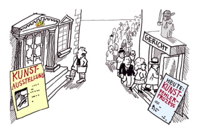
Figure 1: Public is interested in ...

This unhappy situation and the often long duration of lawsuits has led the Medical Associations (Ärztekammern) in Germany which include all German medical doctors – even the retired ones – to establish expert committees to help resolve these problems with somewhat greater discretion.