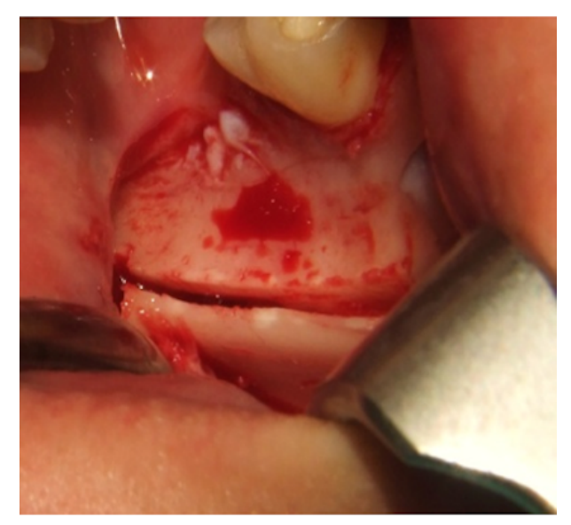
Figure 2: The cranial cut through the cortex is placed on the lateral aspect of the left ramus and the anterior vertical cut was made in the mandibular body in the third molar region in order to harvest the bone graft.