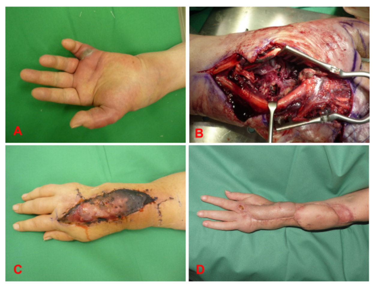
Figure 3: A 56-year-old female with a massive hand phlegmon due to an infected wrist prosthesis (A preoperatively, B intraoperatively); wound necrosis after reconstructive surgery with a free fibula flap (C); follow up result after several debridements and additional gracilis flap 5 months after discharge (D).