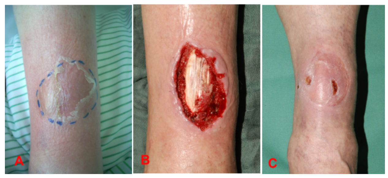
Figure 4: A 60-year-old female with an abscess and surrounding erysipelas on the left lower leg (A); wound defect size after first debridement (B); final result after vacuum therapy for improving wound granulation and skin grafting for defect closure (C).