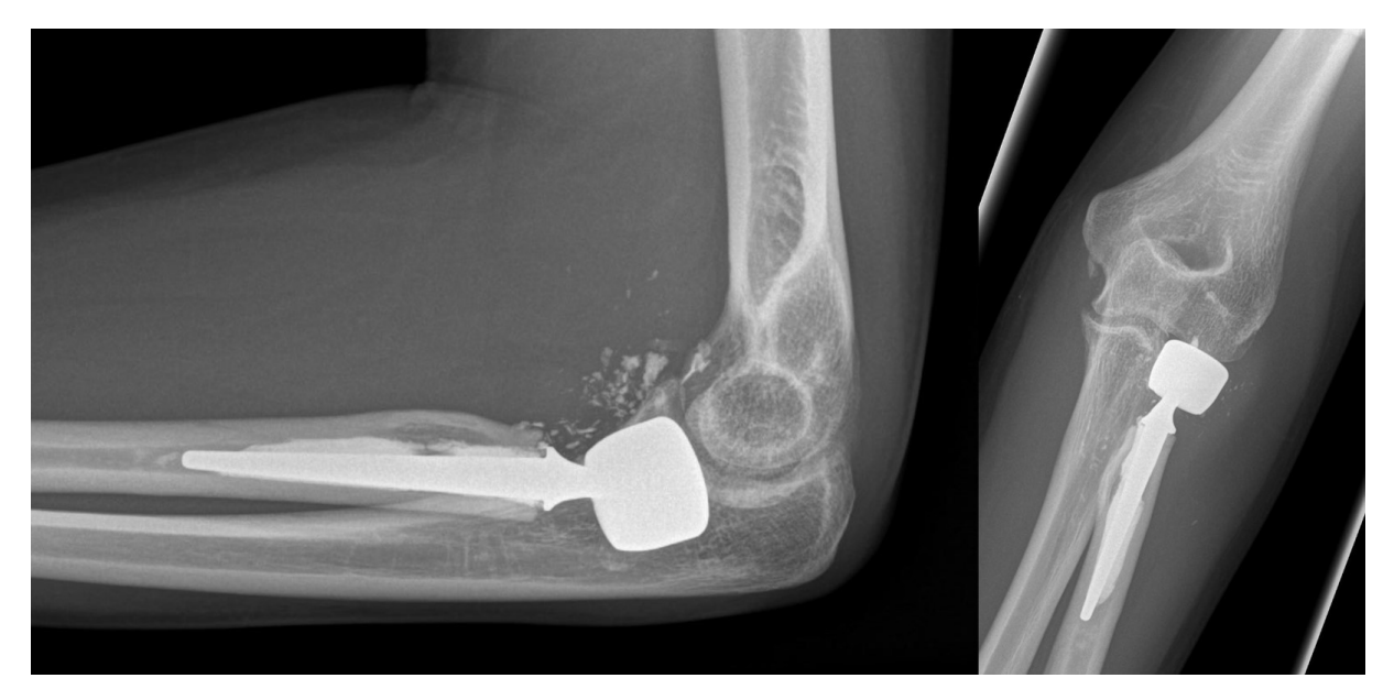
Figure 4: Same patient 12 months after the injury: grade 1 degenerative changes and heterotopic ossifications at the elbow, but good to excellent functional results. No signs of loosening of the radial head prosthesis.

[13], [15]. Heterotopic ossification was graded as I, II, III or IV according to Brooker et al. [16]. Furthermore, radiographic signs of loosening of the radial head prosthesis (radiolucent lines, osteolysis, and proximal resorption of the radial head) were evaluated according to Popovic et al. [17]. Fracture union at the coronoid process was defined as bridging bone on anteroposterior and lateral radiographs.