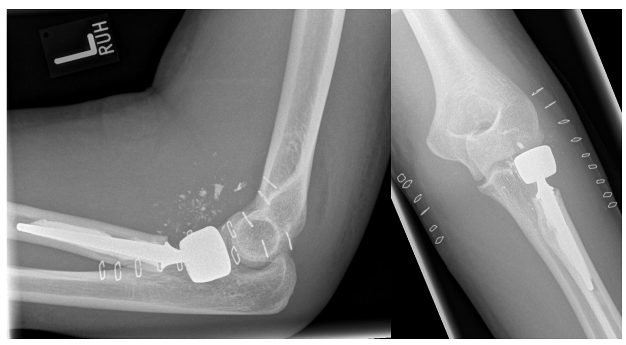
Figure 3: Postoperative radiographs after implantation of a cemented bipolar radial head prosthesis