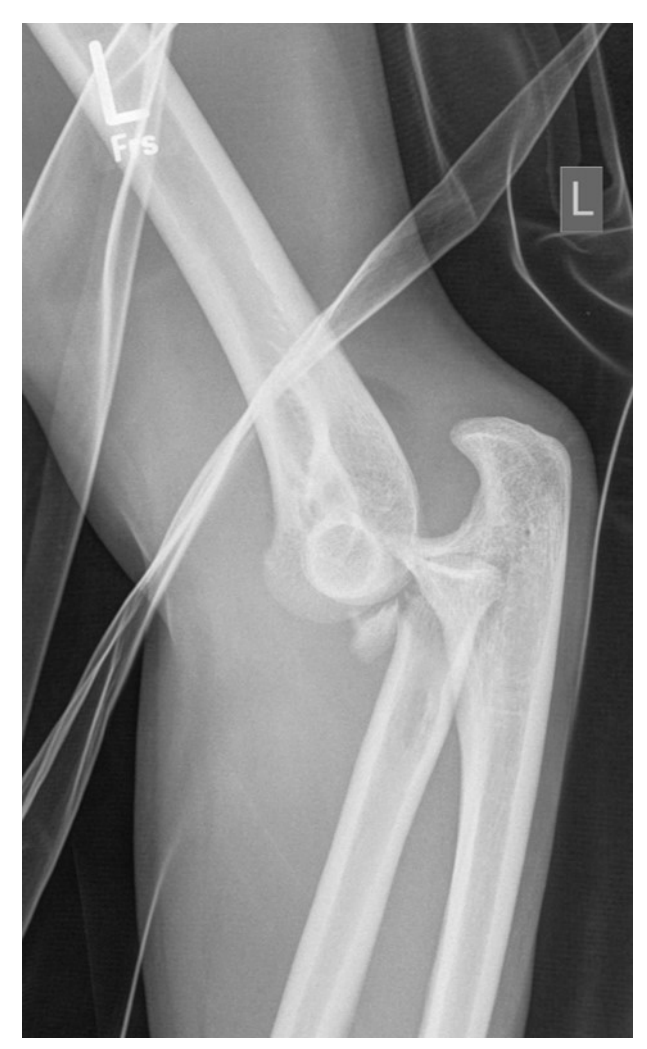
Figure 1: Female patient (36 years) with a Mason type III fracture of the radial head combined with a posterior elbow dislocation. Radiographs on the day of the injury.