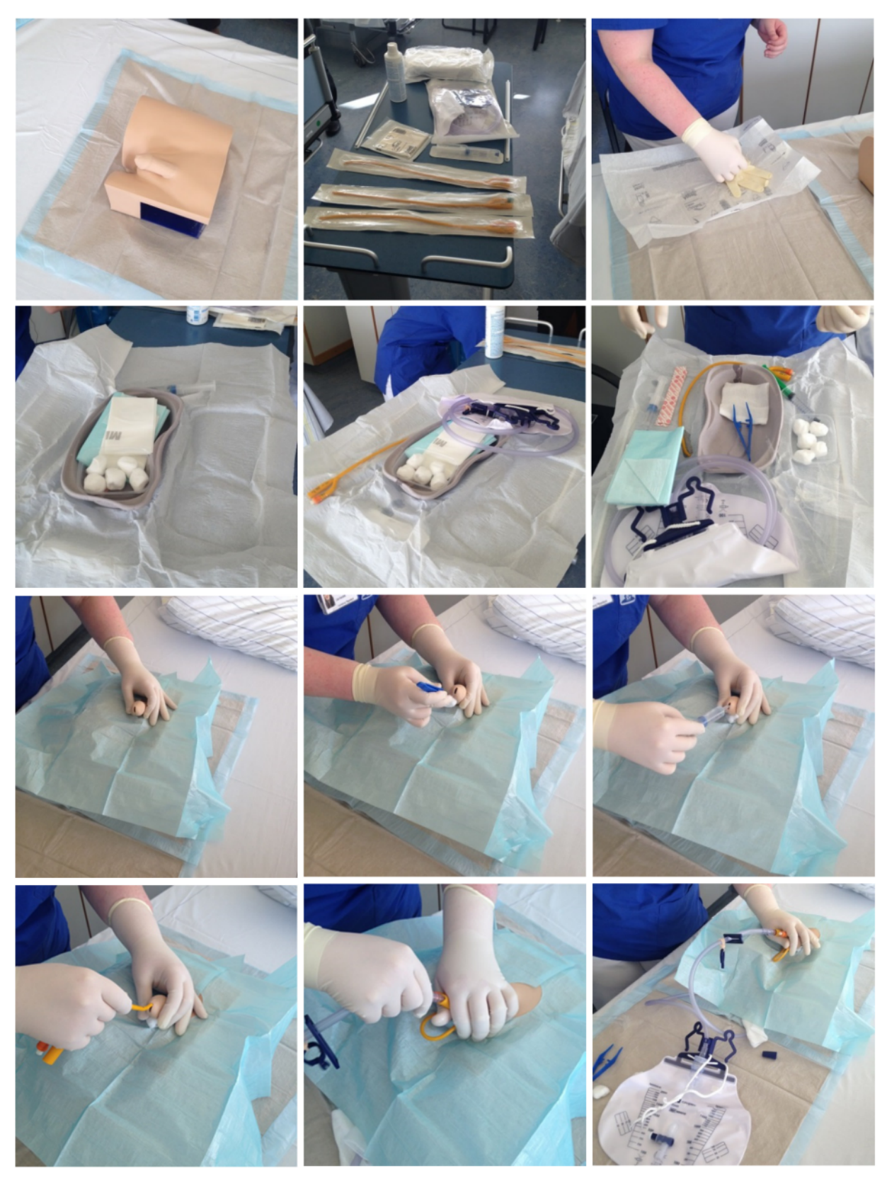
Figure 1: Demonstration of the insertion of a catheter using a patient dummy