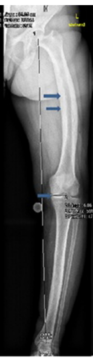
Figure 2: Weight bearing anteroposterior left lower limb radiograph shows varus deformity of the left lower extremity and narrowing of the medial knee joint and narrowing of the hip joint as well associated with unusual cortical thickening and bone enlargement (arrows). The lateral distal left femoral angle measured 106 °, which means approximately 20° deviation from the norms (arrow).

left femoral angle measured 106°, which means approximately 20° deviation from the norms (Figure 2). Skull radiographs showed the cotton wool appearance, disorganized trabecular with areas of sclerosis which are poorly defined and fluffy. Widening of the diploic space and relatively indistinct outer table, and the frontal sinuses are enlarged. No hyperostosis of the skull base was noted. These findings reflect the underlying pathologic changes of osteoblastic repair and are usually pathognomonic (Figure 3). The patient underwent laboratory investigations with blood and urinary tests. Serum bone alkaline phosphatase was high (four times greater than the normal value), which is reflective of the rapid new bone turnover. Other laboratory studies showed normal levels of calcium, phosphate, PTH and vitamin D levels.