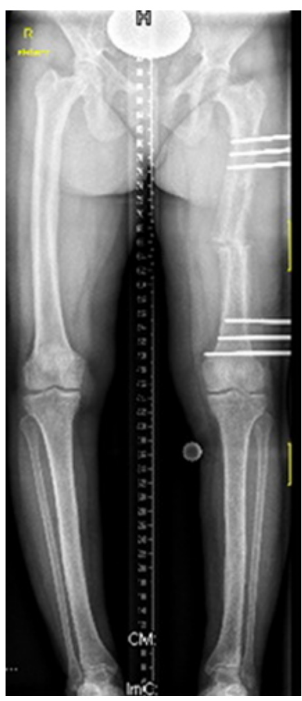
Figure 4: The patient underwent diagnostic arthroscopy of the left knee and mid-shaft osteotomy of the left femur with acute correction against varus position by means of fixations which was done by using a unilateral fixator (LRS, Biomet Company USA).