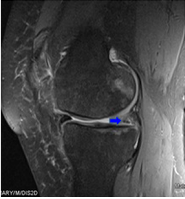
Figure 1: Sagittal T1-weighted MRI of the left knee shows no attachment of the posterior horn of the medial meniscus to the tibial plateau, but instead the meniscofemoral ligament (ligament of Wrisberg) joins the posterior horn of the meniscus to the lateral surface of the medial femoral condyle, i.e. discontinuity between the anterior and posterior horns, causing effectively the development of degenerative lesion of the posterior horn of the left medial meniscus (arrow).

bossing. Decreased active and passive range of motion (ROM) associated with relative left thigh atrophy most likely because of feedback inhibition to the quadriceps due to pain. Palpation of the left knee showed joint line tenderness, and extensor mechanism pathology associated with mechanical blocking (i.e. decrease in active and passive motion). Squatting (hyperflexion) exacerbated the pain.