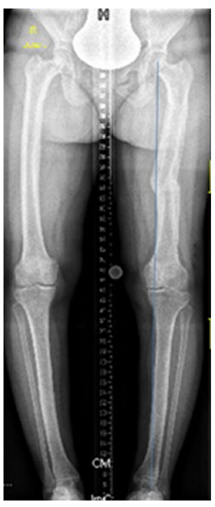
Figure 5: Six months postoperative radiograph showed that complete healing was accomplished, and the fixator was removed. There was a dramatical improvement of the mechanical axis, though still minimal varus deviation exists.