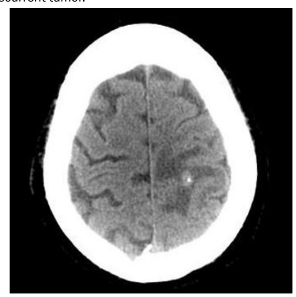
Figure 1: CT brain showing metastasis in the left parietal area

munoprofile was compatible with renal cell carcinoma. The patient then had 14 radiation seances to the brain; after that he was put on the new drug, sorafenib (approved by the U.S. Food and Drug Administration in December 2005). The tumor kidney was removed 11 months after metastasis resection. On his followup visit three years later the patient was neurologically intact. He was on phenytoin and sorafenib. The last MRI, 4 years after the initial surgery, looks stable without residual or recurrent tumor.