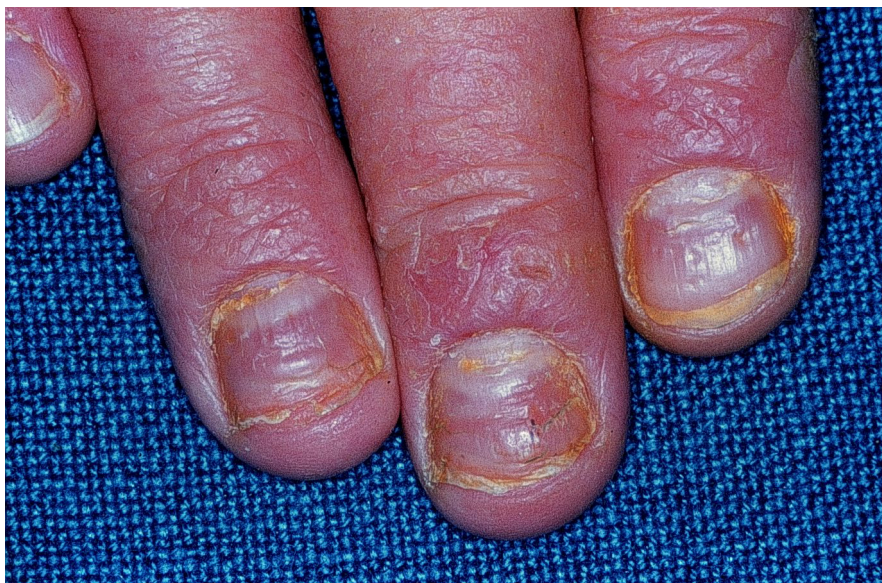
Figure 3: Formalin-induced contact dermatitis of the nails