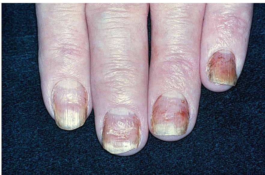
Figure 4: Dermatitis of the nails in a patient with atopy

question whether nails are alive or dead one should realize that the germinative layers of the nail matrix continue to divide, undertake DNA synthesis and differentiate to produce the nail plate throughout life. Thus with the criterium of growth nails fulfil a hallmark of life [21]. Nail growth has been studied by many authors employing several different methods; e.g., observation of the distal movement of a reference point on the nail plate [21], following up changes in the volume of nail indentations drilled with a dental burr until they grow out of the nail [22] and examination of the microrelief of the nail surface by computerized optical profilometry [23]. Nail growth can lead to elongation or thickening of the nail plate. Normal fingernail growth is assumed to vary from less than 1.8 and to more than 4.5 mm per month [24]. The middle finger shows the greatest rate, while thumb and little finger show the slowest rate of nail growth [25]. Several factors affect nail growth [21]. Faster growth is