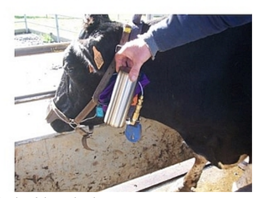
Figure 6: Different location of canisters on the body of the animal