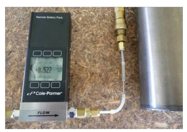
Figure 7: A flow meter on the atmospheric side of the restrictor when measuring flow rate