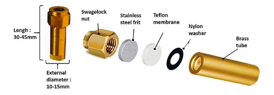
Figure 2: SF<sub>6</sub> permeation tube design