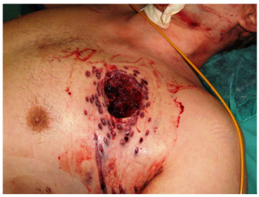
Figure 3: Large thoracic wound due to a shotgun