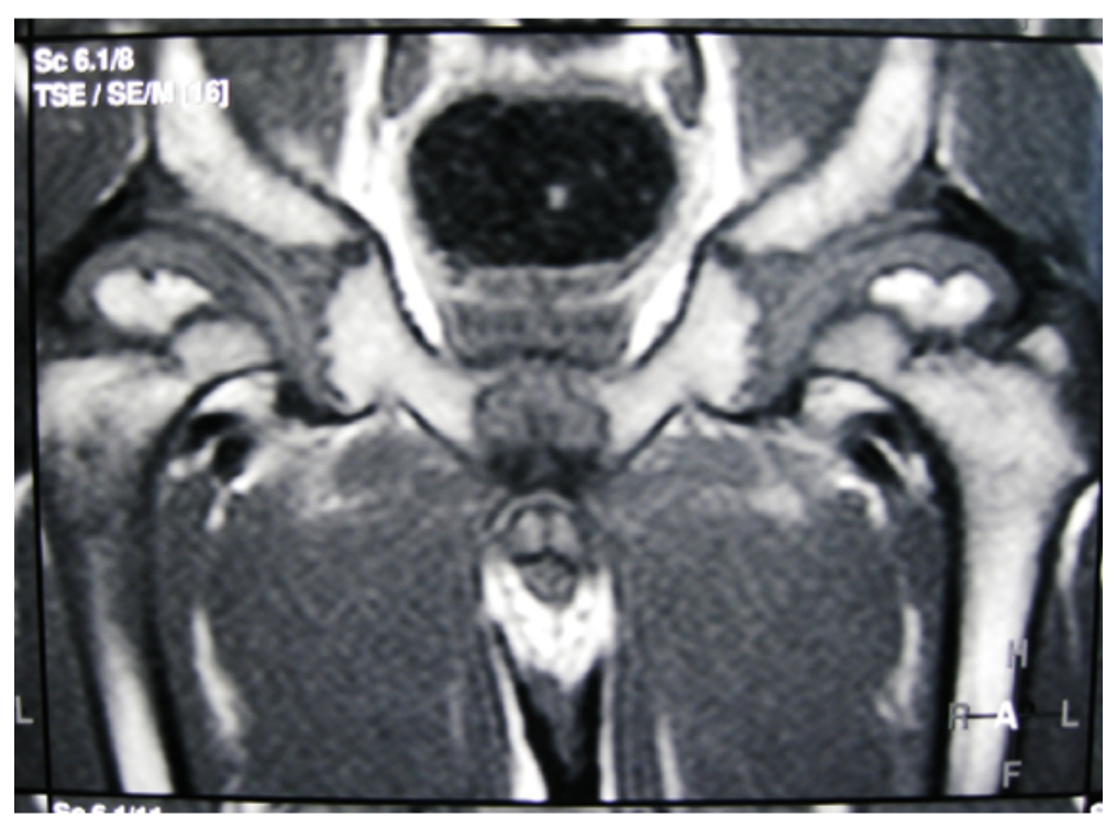
Figure 4: MRI image showed defective ossification of the femoral heads confirmed the superolateral femoral head collapse (a feature of progressive dysplasia and severe joint degeneration) associated with femoral head osteonecrosis (note the medial beaking of the femoral heads). The latter is the reason of femoral head collapse.