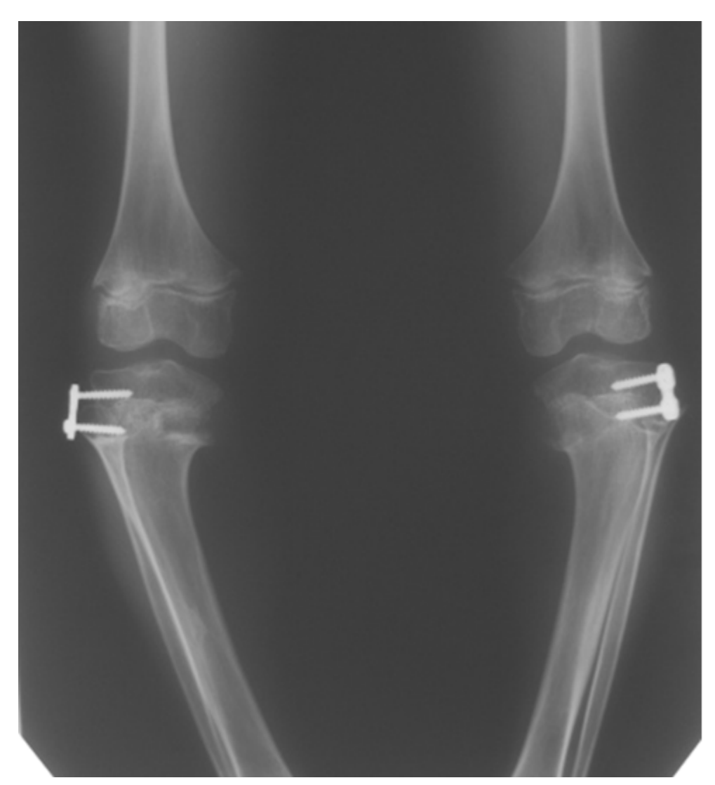
Figure 6: Anteroposterior standing radiograph of the knee joints, 3 months after temporary lateral hemiepyphyseodesis of both tibiae

former there were null mutations. In a review by Paupe et al. [8] it is stated that to date, there have been 16 different mutations found in 21 families.