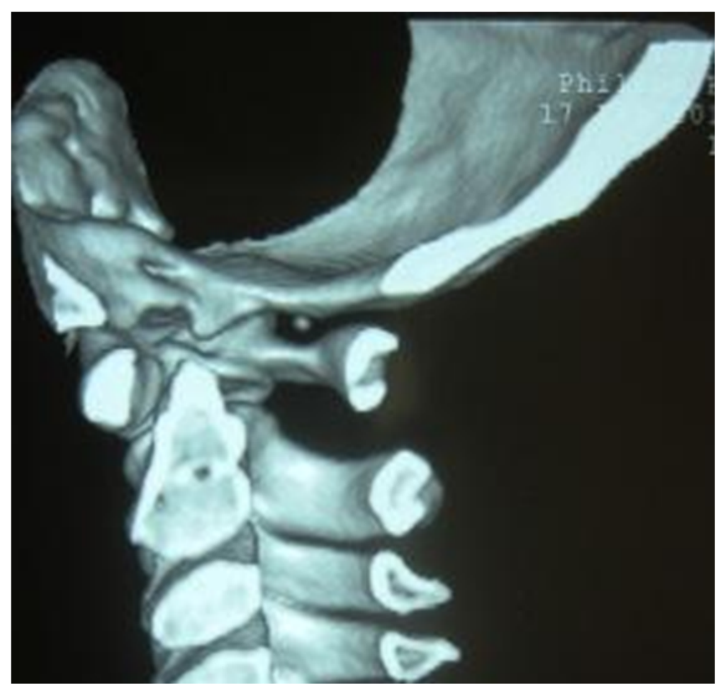
Figure 5: 3D reconstruction CT scan showed normal atlanto-dens distance with no odontoid hypoplasia. Note the calvarial thickening of the occipital region.