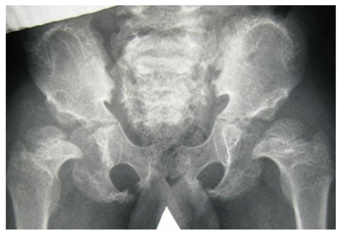
Figure 2: Anteroposterior pelvis radiograph showed a dysplastic pelvis. The iliac crest showed a pathognomonic, semi lunar, irregular lacy margin with a wide irregular sacro-iliac joint. Note the supero-lateral collapse of the femoral heads bilaterally causing lateral displacement of the femoral heads (associated with epi-metaphyseal irregularities). Defective ossification of the acetabuli was evident.